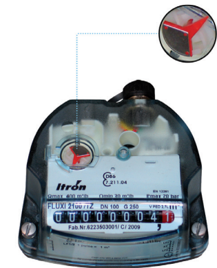
Universal totaliser fitted as standard with Cyble target