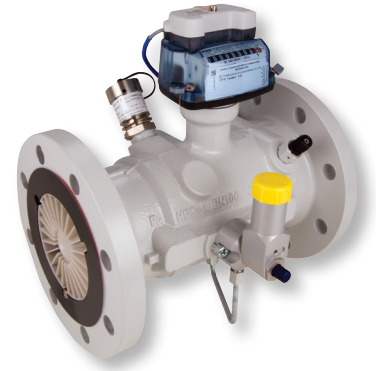
Fluxi 2000/TZ fitted with the universal totaliser and the Cyble Sensor ATEX

For more details about these 4 Cyble Sensors, please consult the relevant brochures online at www.itron.com